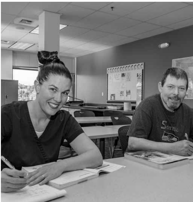
Complete your transfer degree by taking MATH& 107 on Saturdays this winter.

You can complete a 90-credit degree in two or three years or a number of short-term certificates by taking classes solely at East County Campus. Visit EverettCC.edu/EastCounty for more details.