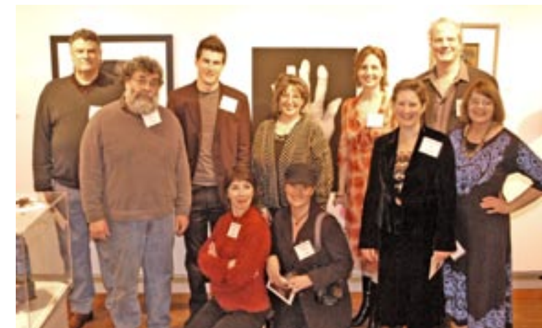
Everett Community College honored outstanding alumni artists (above) in the college's first Alumni Invitational Art Show in February.