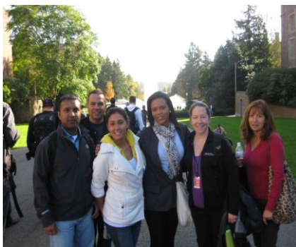
November 2, 2010 UW/Seattle

During the Fall Quarter we have had three successful trips to Universities in the area with TRiO-SSS program students. We provided transportation, arranged to see people in admissions, financial aid and advising, and toured the campus.