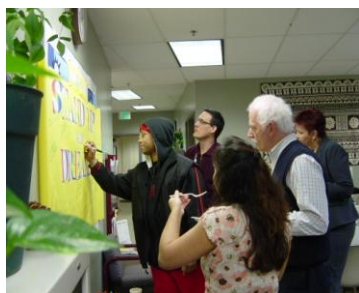
2008 National TRiO Day "Stand Up for Your Dreams!"

"A safe and friendly place...with food, fun & friends."